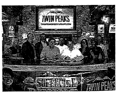
What do these photos say about an Olive Garden restaurant ( left ) and a Twin Peaks restaurant ( right )?